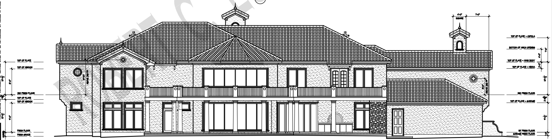
2 REAR ELEVATION 3/16" = 1'-0"