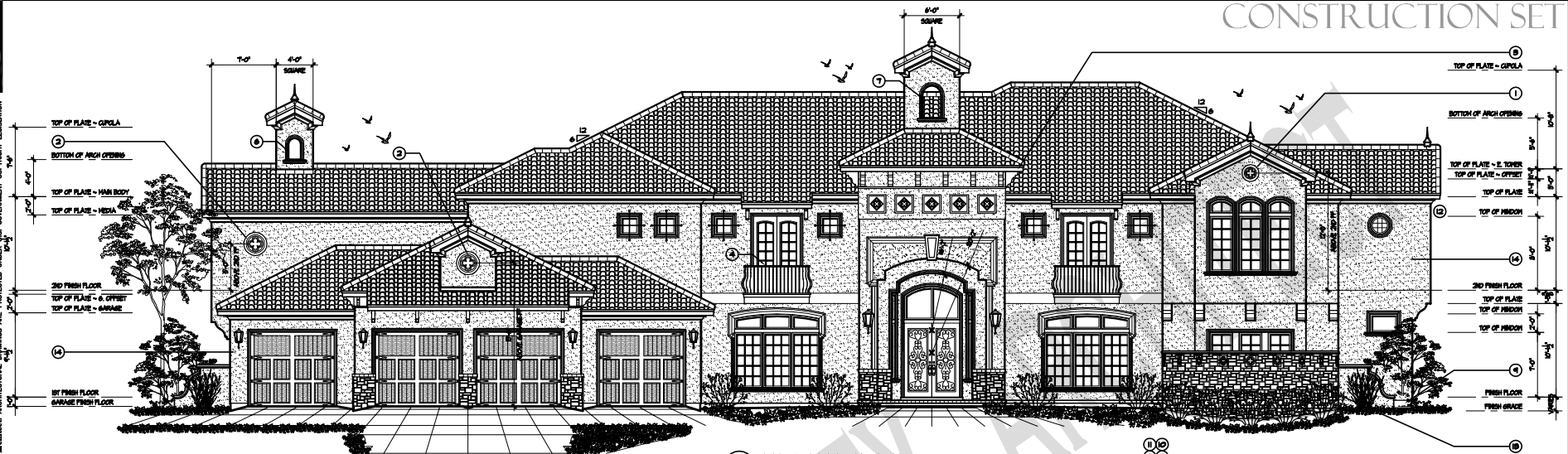
1 ENTRY ELEVATION 3/16" = 1'-0"

THIS DRAWING, AS AN INSTRUMENT OF SERVICE, SHALL NOT BE REPRODUCED OR REUSED IN WHOLE OR IN PART WITHOUT THE WRITTEN PERMISSION OF Robert Lowrey Architectural. ARCHITECTURAL DRAWINGS ARE PROTECTED UNDER U.S. GOVERNMENT COPYRIGHT LEGISLATION.